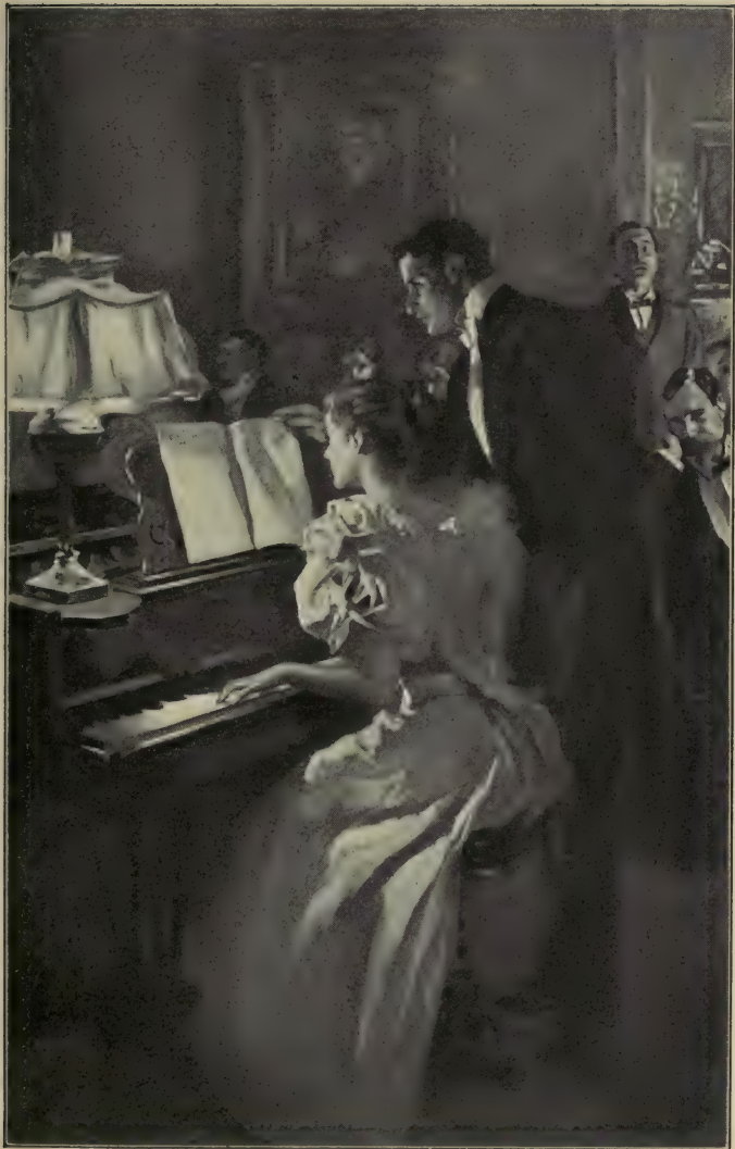
Marshall went at once to the piano.